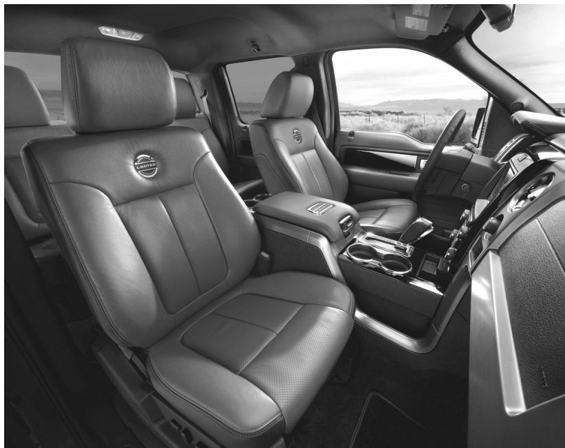
Redefining pickup truck comfort, convenience and connectivity with class-leading levels of content, Limited brings tasteful design touches, inside and out.

Segment-first HID headlamps provide a signature look while delivering two-and-a-half times more light than conventional halogen lamps. Lamp detailing even incorporates F-150 insignias. Jewel-like chrome highlights the bold three-bar grille, tie-down hooks lining the cargo box, the single tip of the tuned exhaust and the tow hooks on 4x4 variants. "LIMITED" dimensional lettering accents the box sides. F-150 Limited is available exclusively with a SuperCrew four-door cab