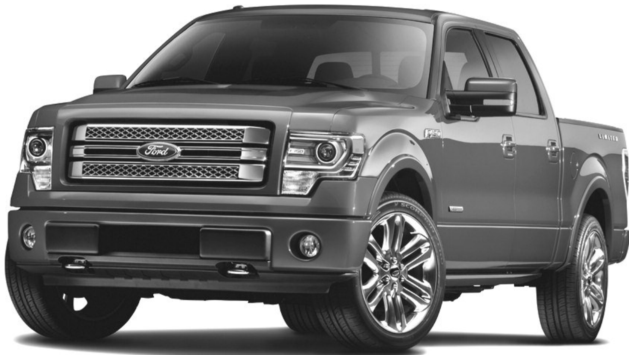
Building on three decades of truck leadership and a decade of luxury pickup innovation, Ford marks the 2013 model year with its most refined F-150 yet.